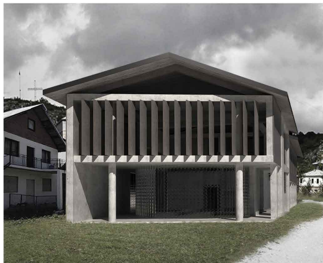
View from the piazza

TOGETHERNESS / tə'geðənis/ noun: the state of being close to another person or other people.