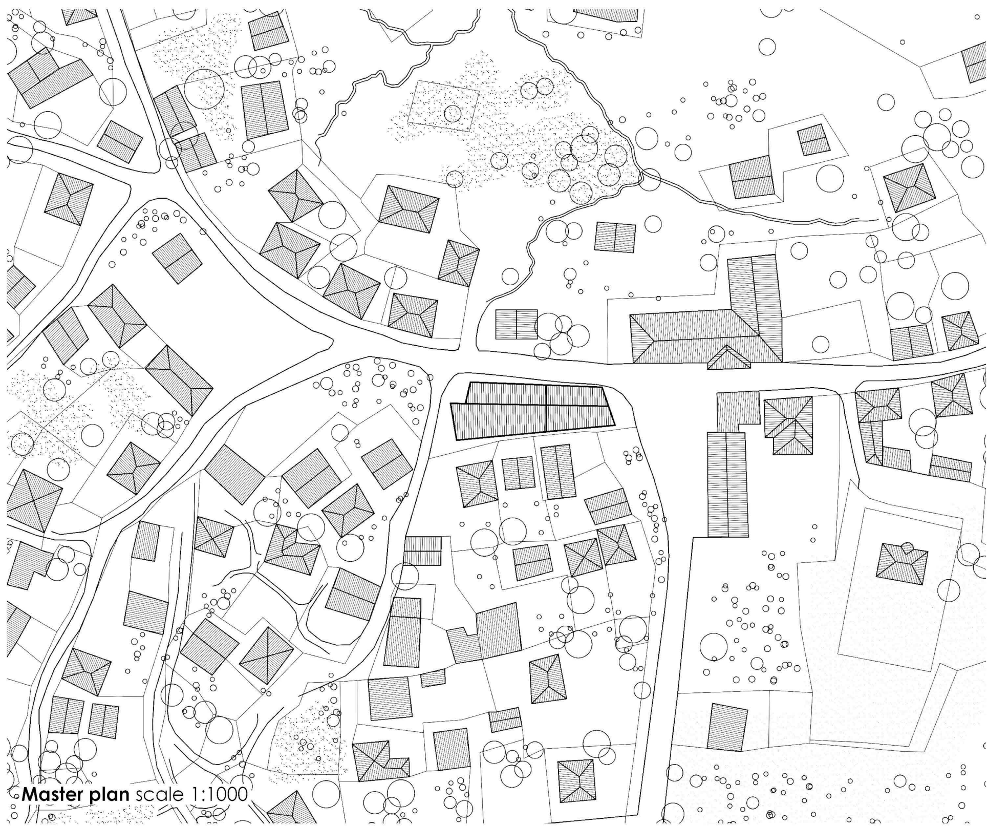
Master plan scale 1:1000